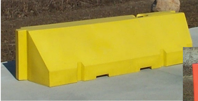
9562 Portable Safety Barricade