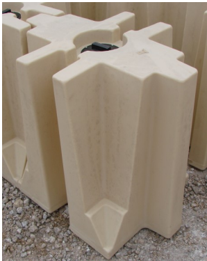
3110 Portable Safety Barricade Corner (Shown) Makes possible right or left 90° corners.

* Also available for 426 and 428 Barricades