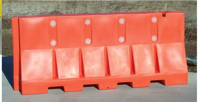
428 Portable Safety Barricade