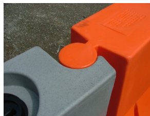
426PL Barricade shown at left with Posi-lock connection. Locks barricades together.