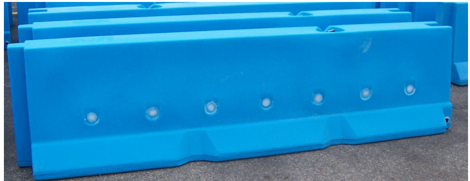
3110 Portable Safety Barricade

* Also available for 426 and 428 Barricades