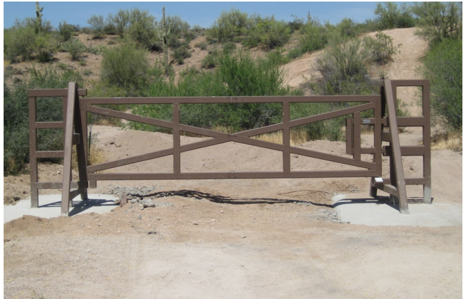
Gate shown protecting a remote road.

Each gate is constructed of 4" heavy gauge square tubing. All hinges are reinforced and locked in place to prevent the removal of the gate from its hinges when closed. The gates support post assemblies extend into the ground 4' for strength and added support.