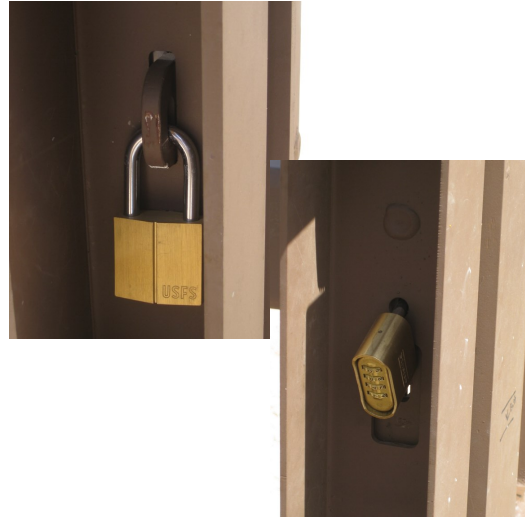
Gate can be opened by either the combination lock or the keyed lock.

The UHMW bottom support is attached to the gate post bottom assembly to guide the gate arm into position while closing.