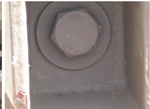
Sag adjustment bolt built-in to top rail.

The Forestry Gate has a height adjuster bolt built-in to the top rail of the gate. This makes it easy to adjust the gate arm for sag. This will keep the latch assemblies perfectly aligned with the locks. Each gate comes complete with a keyed and combination heavy duty lock, instructions and all mounting hardware.