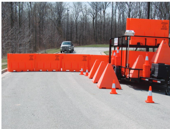
Quick Setup for Road Closing