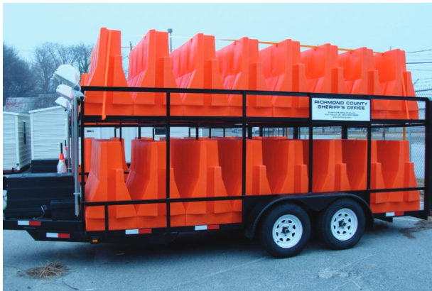
Configured with 96' of Barricades