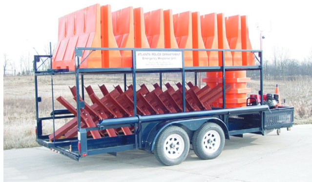
Configured with (10) 3' Hedge Hogs