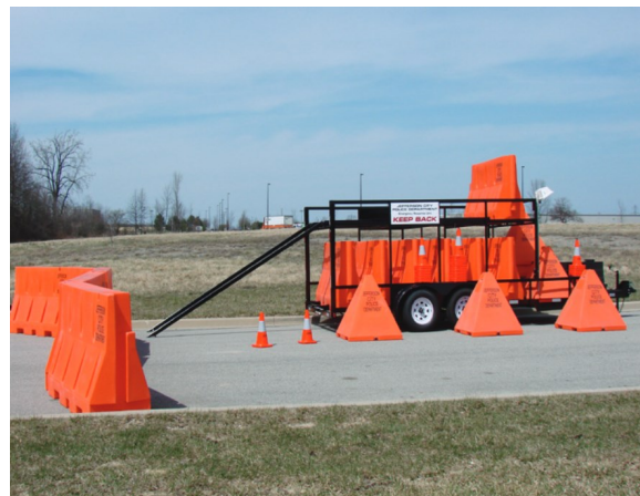
High Visibility Barricades