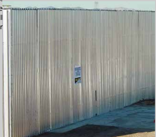
Completed 16' High Revetment Wall Section