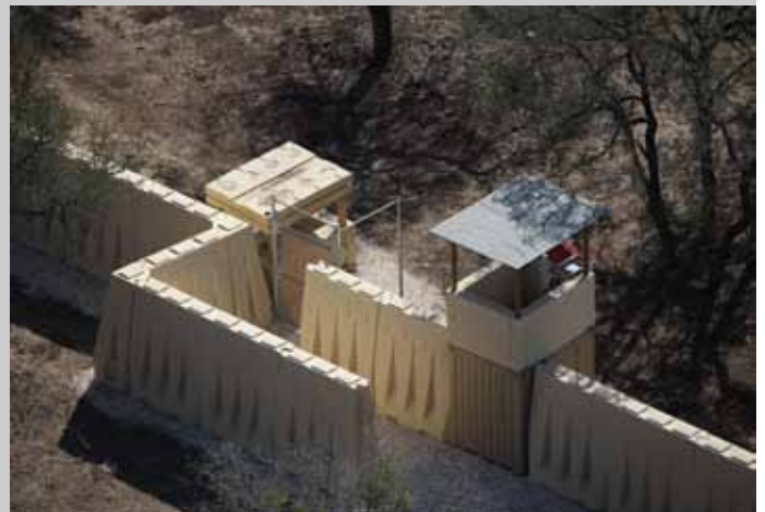
The Personnel Entry Control Point above includes: Houston Barricades, Bunker Check Point, Guard Tower and Man Gate.