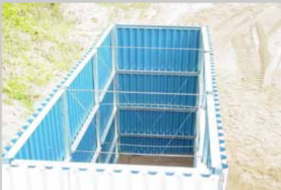
Wall section ready to be filled with sand

Perimeter Security Products Revetment Walls are prefabricated and easy to construct. They provide maximum blast protection. Each system is customized to your needs. Walls are available in heights up to 16'. The width of the wall will be determined by threat protection level and wall height. The galvanized panels resist rusting and will last for years.