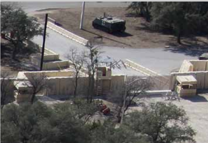
From inside the camp you can see the Check Point bunkers for both ECPs