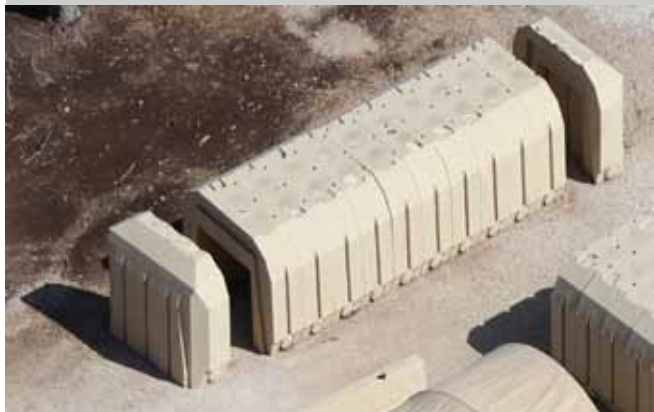
Bunker Cover application in FOB

Perimeter Security Products Bunkers Covers are designed to provide personnel protection during an attack. They are constructed of high density polyethylene. Each section is filled with sand to provide protection from blasts. Sections lock together to form the shelter.