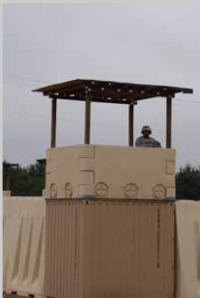
Standard Guard Tower w/Ladder

The Standard Guard Tower is designed to fit on top a standard Conex Container. It is shipped complete with all components and tools needed to assemble. It comes standard with an external ladder. An option step through entry and sloping ladder are available. The Step Thru option keeps you less exposed when entering the tower. The tower walls provide NIJ4 protection when filled with sand.