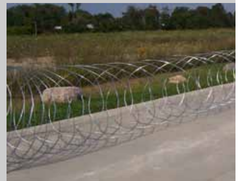
38" Concertina Wire Deployed