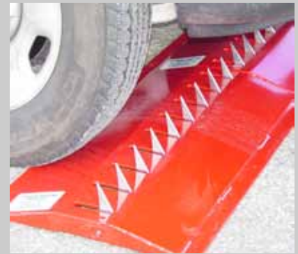
Tire Shredder shown with teeth engaged.