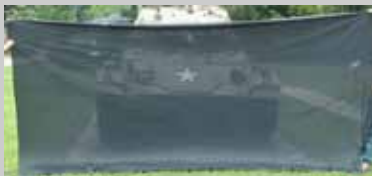
Perimeter Security Veil shown from both sides.

The Perimeter Security Veil (PSV) is ideal for use on Fences, Check Point Bunkers or other exposed perimeter areas in a FOB that you don't want seen. The PSV was evaluated by the US Army Military Police School (USAMPS) and shown to be very useful in blocking the enemy's view of valuable assets inside a facility, while allowing the warfighter the capability of detecting and assessing targets on the exterior. The PSV is 33ft x 7'6" and available in Desert Camo, Tiger Stripe and Woodland Camo.