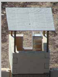
Step Thru w/Ladder

The Standard Guard Tower is designed to fit on top a standard Conex Container. It is shipped complete with all components and tools needed to assemble. It comes standard with an external ladder. An option step through entry and sloping ladder are available. The Step Thru option keeps you less exposed when entering the tower. The tower walls provide NIJ4 protection when filled with sand.