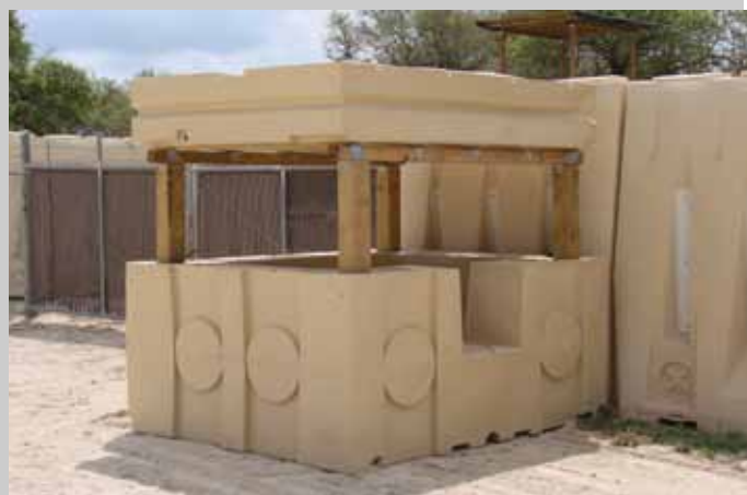
Check Point bunker as part of a ECP

Perimeter Security Products Checkpoint Bunkers are available with or without overhead protection and there is a model for sand or water fill. Both provide NIJ4 protection. The step thru design makes it easy for the sentry to exit the bunker for inspections.