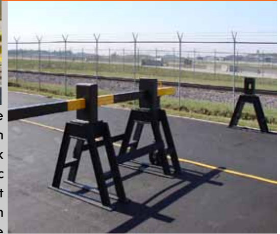
Slide Arm Barrier Gate in open position.

The Slide Arm Barrier Gate is available in any length up to 40ft. The gate slides on a heavy duty roller with a bogey support wheel on each end for support and operation. The beam is painted alternating black and yellow for high visibility in any conditions day or night. Prismatic reflection tape is an option. The heavy duty gate provides excellent protection and comes complete with a tool set to speed assembly. Each gate can be mounted to the top of concrete barricades or gate frame supports as shown above. The gate can be disassembled and moved on a common pallet, asset recoverable.