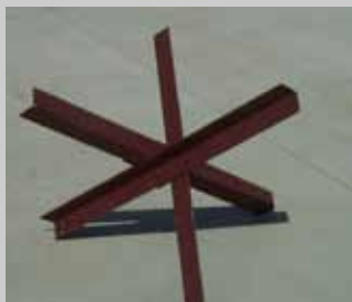
5' Hedge Hog

Perimeter Security Products Hedge Hogs are prefabricated and easy to assemble. They are available in 3', 5' and 7' models.