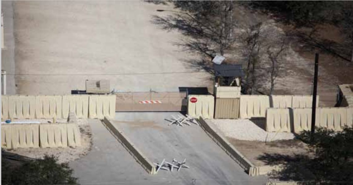
The picture above shows a typical Vehicle Entry Control Point constructed using Creative Building Product components including Houston Barricades, Hedge Hogs, Bunker Check Point, Guard Tower, 3110 Barricades and Slide Gate.

The Entry Control Point, (ECP) is one of the most important aspects of any Forward Operating Base (FOB). The ECP defines how personnel, vehicles and materials enter a base. Each FOB contains multiple ECPs, some for Vehicles and some designed for Personnel. At Perimeter Security Products we know that threats change, that's why we work with Security Forces, Engineers and Force Protection Experts to create innovative modular products that can be used in combination, to create ECP s that can be configured to protect against a specific threat and easily modified as situations change.