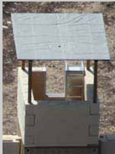
Step Thru w/Ladder

The Standard Guard Tower is designed to fit on top a standard Conex Container. It is shipped complete with all components and tools needed to assemble. It comes standard with an external ladder. An option step through entry and sloping ladder are available. The Step Thru option keeps you less exposed when entering the tower. The tower walls provide NIJ4 protection when filled with sand.