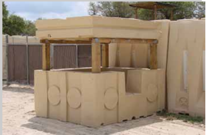
Check Point bunker as part of a ECP

Perimeter Security Products Checkpoint Bunkers are available with or without overhead protection and there is a model for sand or water fill. Both provide NIJ4 protection. The step thru design makes it easy for the sentry to exit the bunker for inspections.