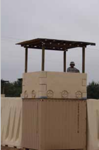
Standard Guard Tower w/Ladder

The Standard Guard Tower is designed to fit on top a standard Conex Container. It is shipped complete with all components and tools needed to assemble. It comes standard with an external ladder. An option step through entry and sloping ladder are available. The Step Thru option keeps you less exposed when entering the tower. The tower walls provide NIJ4 protection when filled with sand.